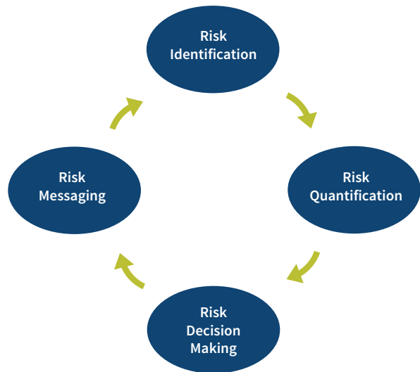
FIGURE 1: ERM PROCESS CYCLE